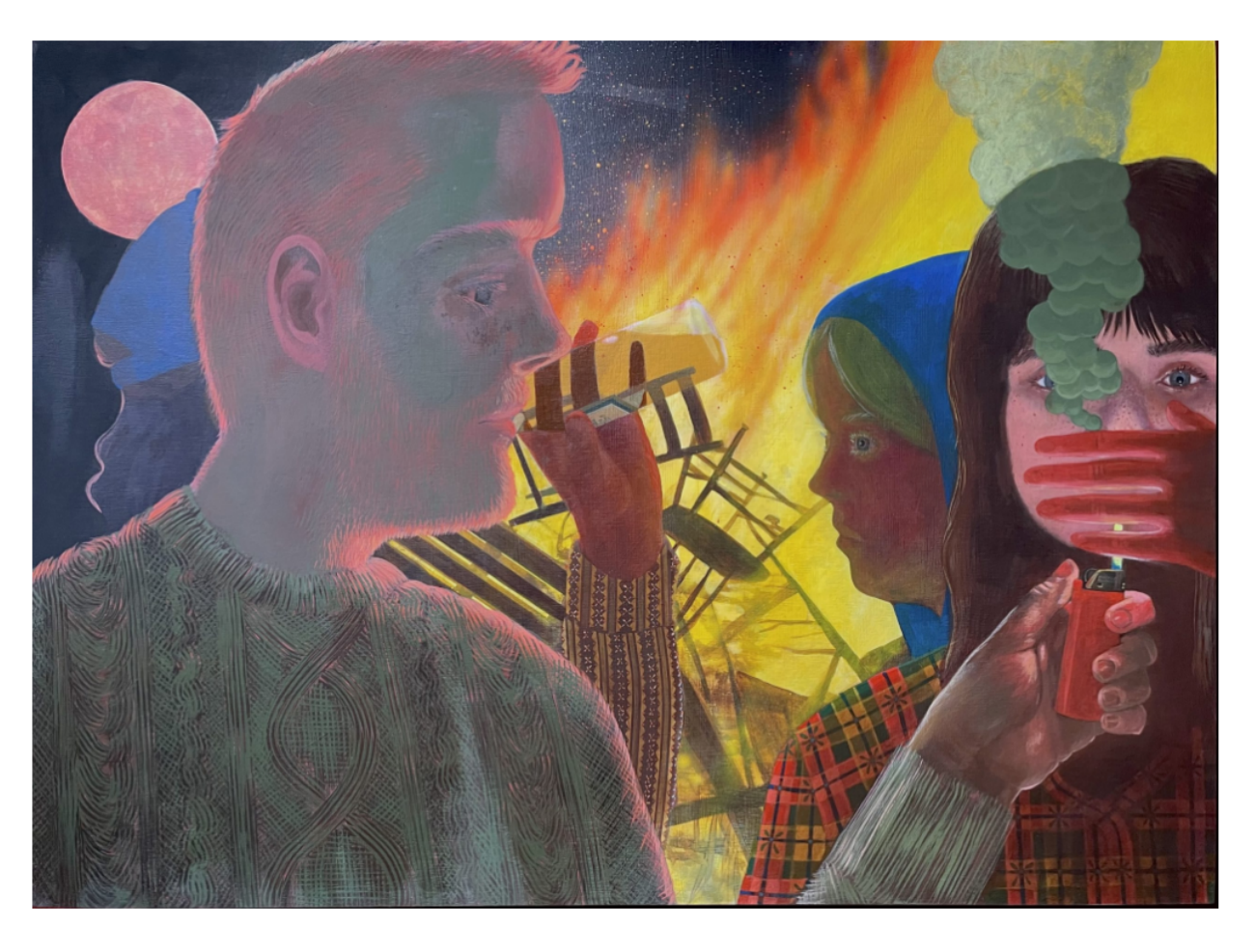
Marcelle Reinecke "Harvest Moon" (2024), acrylic and flashe on panel, 22 x 30 inches

This two-person show at the Ruffed Grouse Gallery in Narrowsburg is an amusing pairing of dynamic figuration and biological abstraction. Taking inspiration from late Medieval and early Renaissance aesthetics, Julia Policastro's recent three-dimensional quasi-sculptural paintings engage with familiar shapes such as windows, architectural spaces, and organic forms to create atypical vignettes. "Windowsill Sunset" (2024), made of wood, acrylic, foam board, plaster, and joint compound, for instance, nearly pops off the wall with its playful presence. Figurative painter Marcelle Reinecke employs a rich color palette to tease out visions of female figures engaging in familiar activities such as swimming, napping, and hiking in the woods, all laced with a voyeuristic edge. In "Harvest Moon" (2024), several characters stand around a tremendous midnight fire that illuminates their distinct moods: one figure slugs a drink; another, hooded in blue, looks off blankly; and a woman with freckles stares right at us as the dude to her left lights up her cigarette. The mood is fascinatingly bizarre — I wanted to enter the picture plane, directly into Reinecke's peculiar party.